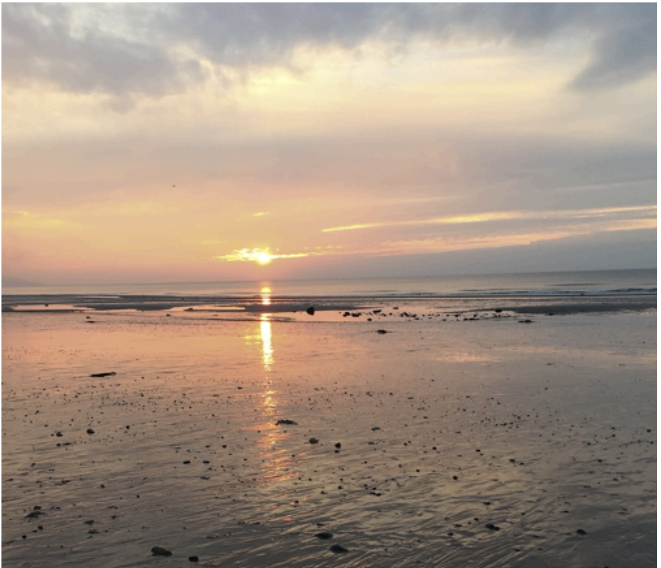
Kirk Michael beach looking towards Peel

https://pilgrimageisleofman.im/triskelion-way/