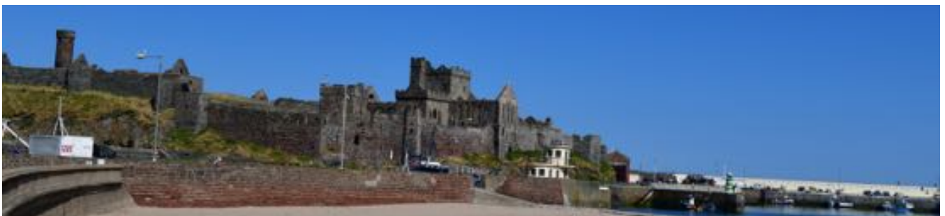
Peel Castle with the ancient Cathedral of St German

All of our churches are funded by local congregations for the benefit of the local community and for visitors alike. We do of course thank you for any gift you may choose to leave but would encourage you to help just as much leaving comments in our visitors' books, and by spreading the word when you've discovered one of our treasures!