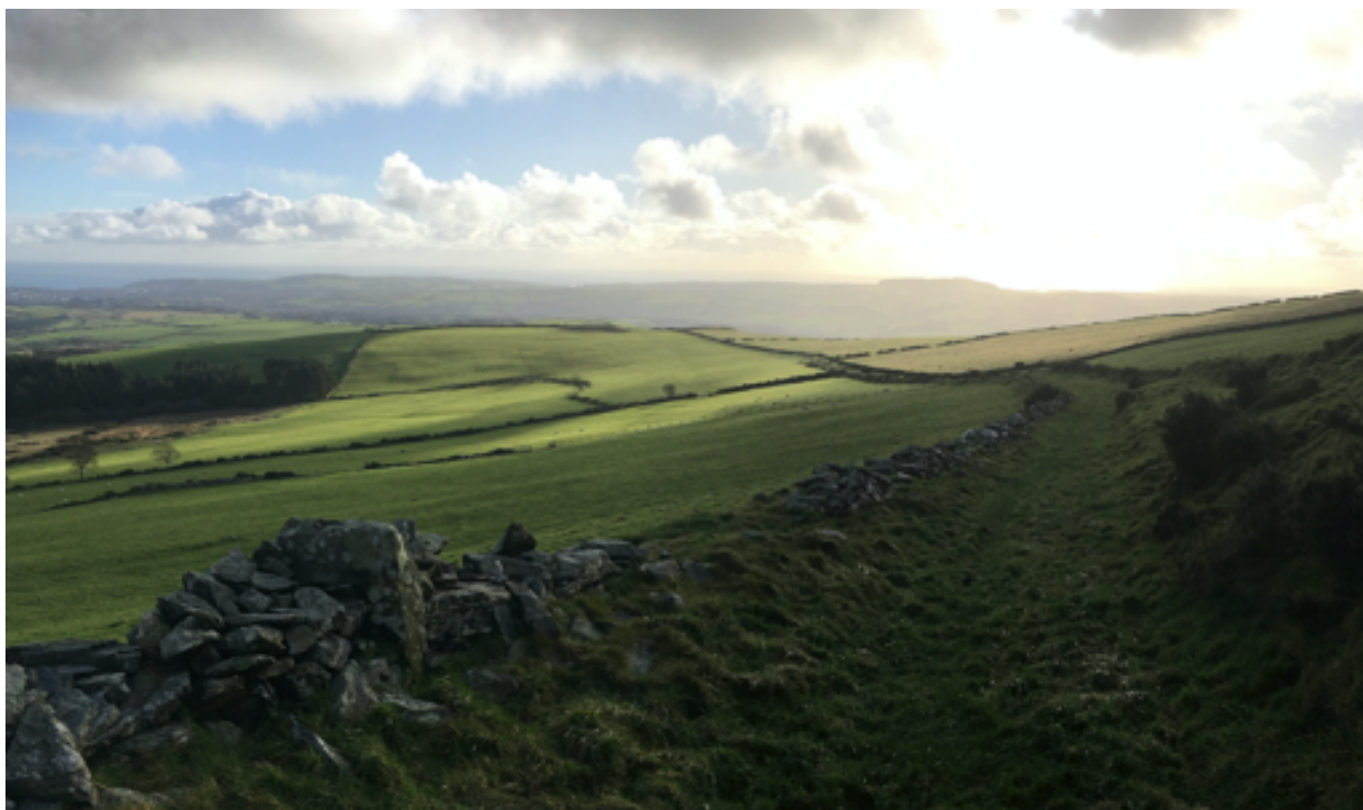
View from the north of Crosby on the way to St Luke's Church

To enable our mission and ministry to grow and be sustainable and resilient.